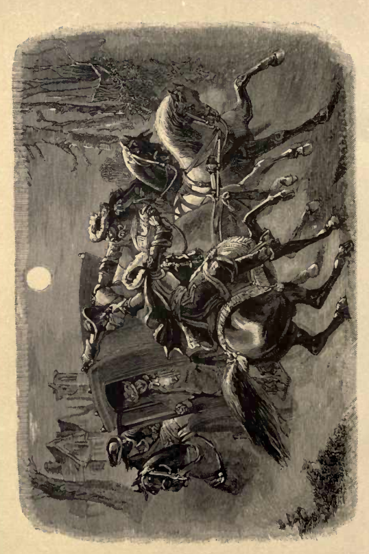
Dumas, Vol. Sixteen RADUL PRESENTING HIS PISTOL THREW HIMSELF ON THE LEADER, COMMANDING THE COACHMAN TO STOP