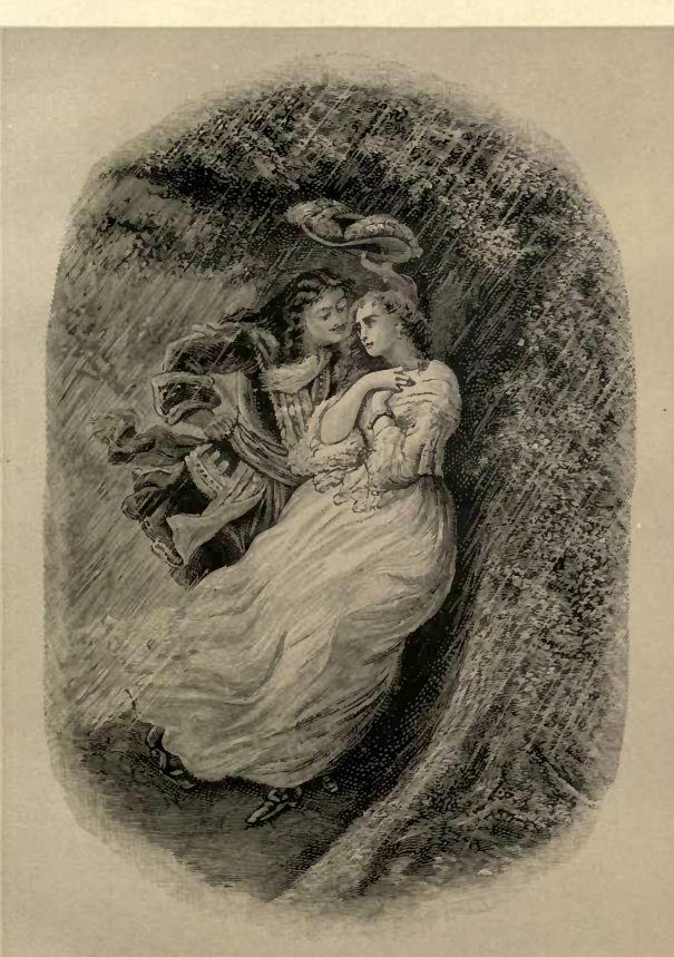
AS THE RAIN DRIPPED MORE AND MORE THROUGH THE FOLIAGE OF THE OAK, THE KING HELD HIS HAT OVER THE HEAD OF THE YOUNG GIRL